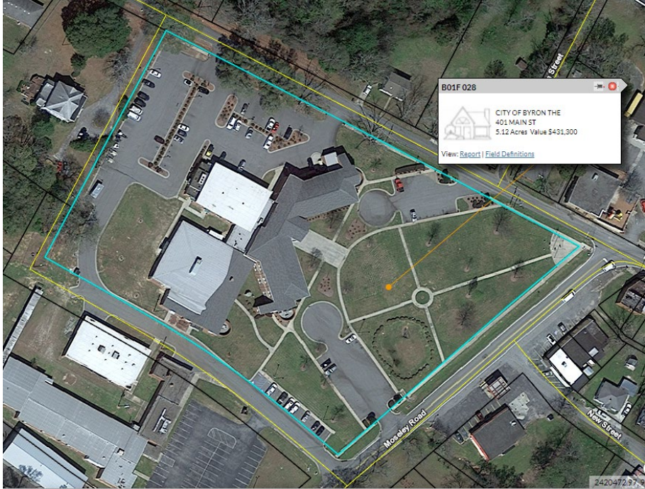
Old School (39 visits, 7 apps of Lawn Care, 3 apps of Pine Straw)