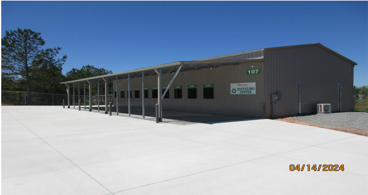
Main Street Right of Way (39 visits,7 apps of Lawn Care, 3 apps of Pine Straw)